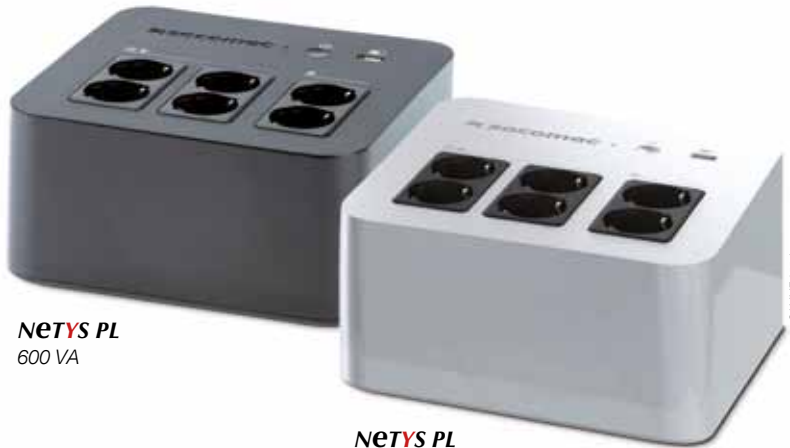
NETYS PL 600 VA