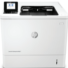
HP LaserJet Enterprise M607dn