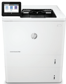
HP LaserJet Enterprise M609x