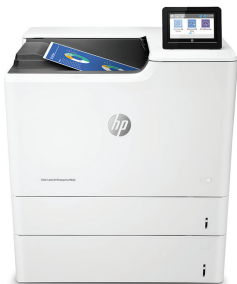
HP Color LaserJet Enterprise M653x