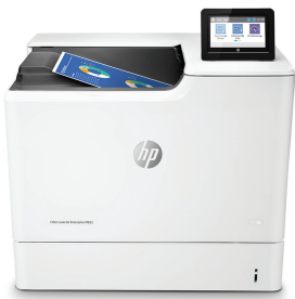
HP Color LaserJet Enterprise M653dn

This HP Colour LaserJet Printer with JetIntelligence combines exceptional performance and energy efficiency with professional-quality documents right when you need them – all while protecting your network with the industry's deepest security. 1