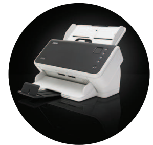
Alaris S2050/S2070 Scanners