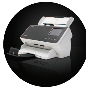
Alaris S2060w/S2080w Scanners