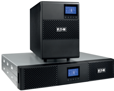
9SX Rack & Tower models