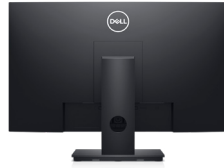
Back view - Cable management slot

Easily adjust the panel to your preferred viewing position.