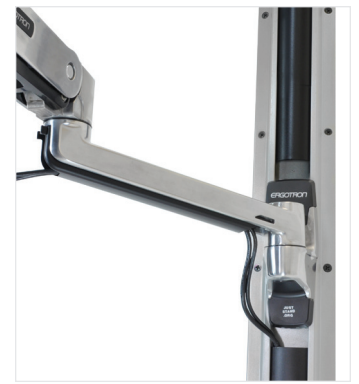
RECOMMENDED: ATTACH WALL MOUNT ARM TO AN ERGOTRON WALL TRACK USING BRACKET (97-091)