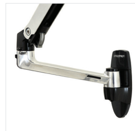
LX EXTENSION INCREASES REACH BY 9" (23 CM) POLISHED ALUMINUM (45-289-026) MATTE BLACK (45-289-224)